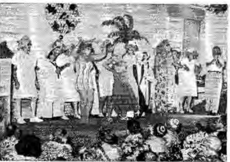
"Tales of South Seas" show put on by members of Starlitter Chapter, Lakewood.