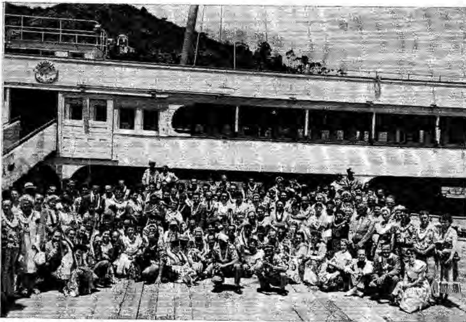
Typifying the Smooth Dancer's program of dancing plus a rounded social life is this 1952 outing to Catalina Island.