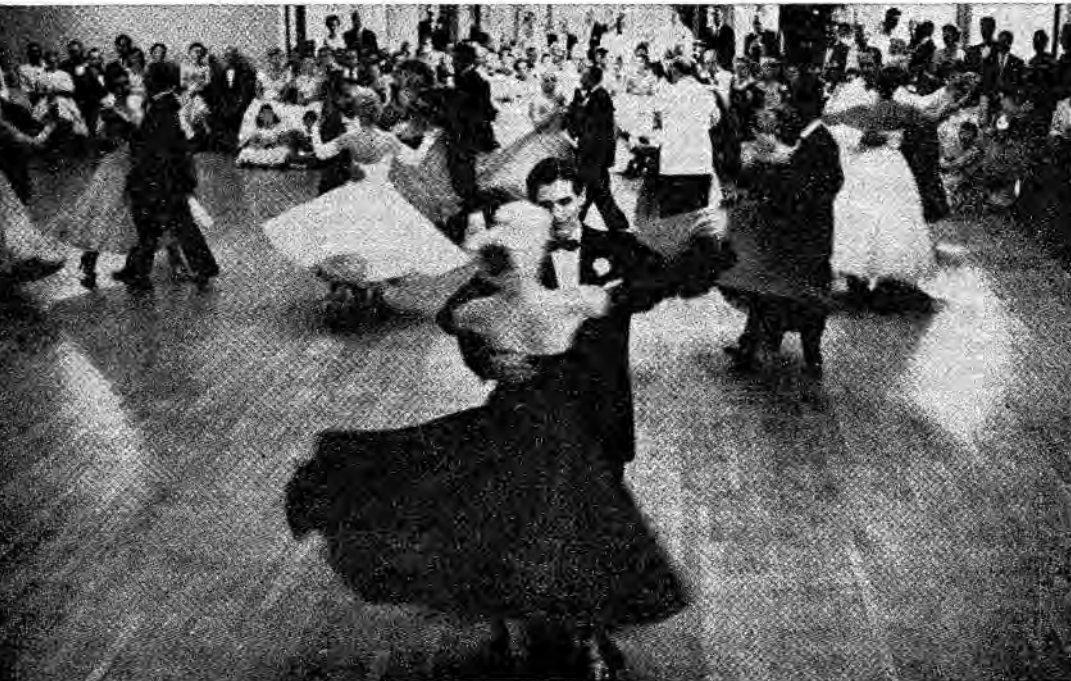
1957 contest scene at Oakland convention, hosted by Lake Merritt Chapter.

During the war years of gasoline short- (Continued on page 24)