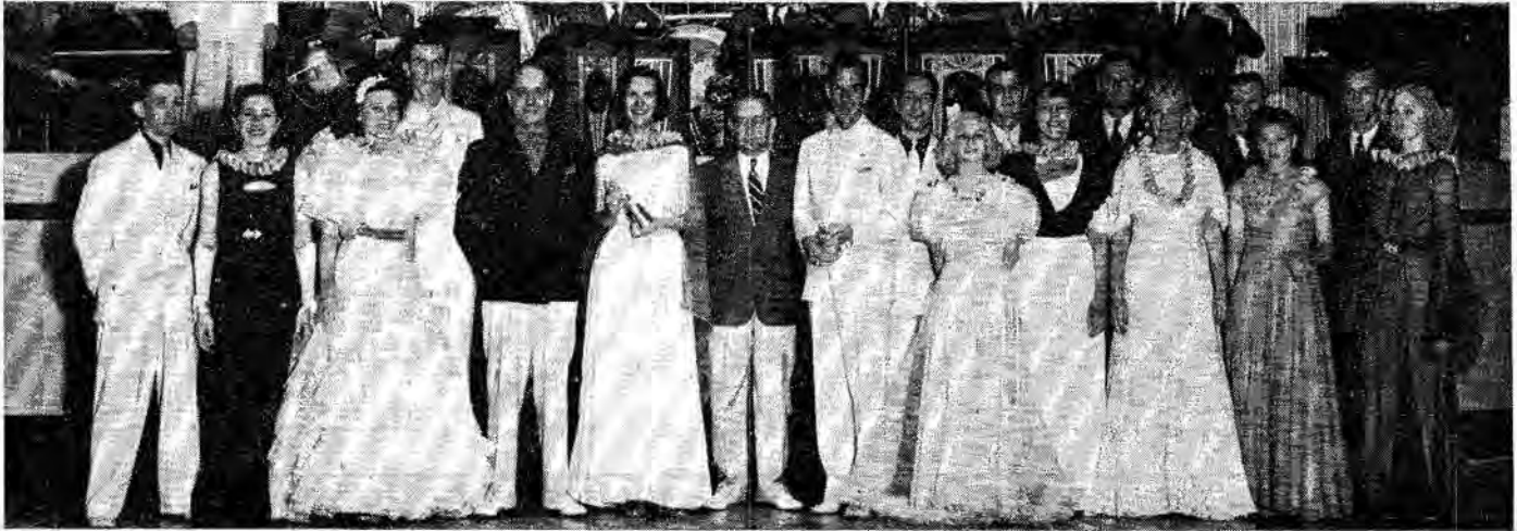
Silver Cup Award Competition July 10, 1937, at Pasadena, during Smooth Dancers' first year.