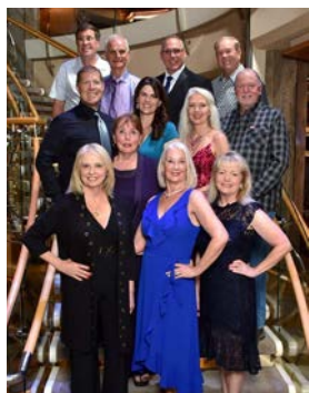
Wendy's Birthday Celebration

The Fairfax Grange is open Friday evenings from 7:00 to 9:00 pm for social dancing. This is a great time to practice your moves!