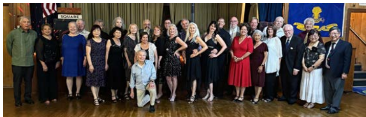
Bakersfield Smooth Dancers 60th Anniversary