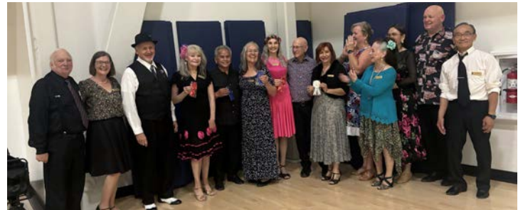
Mock Competition Winners