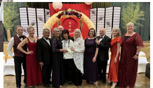
Palomar members having fun at Visalia

Eleven Palomar Smooth Dancers members attended the Visalia Coronation and said they had a blast. Below are a couple of pictures from that fun weekend.