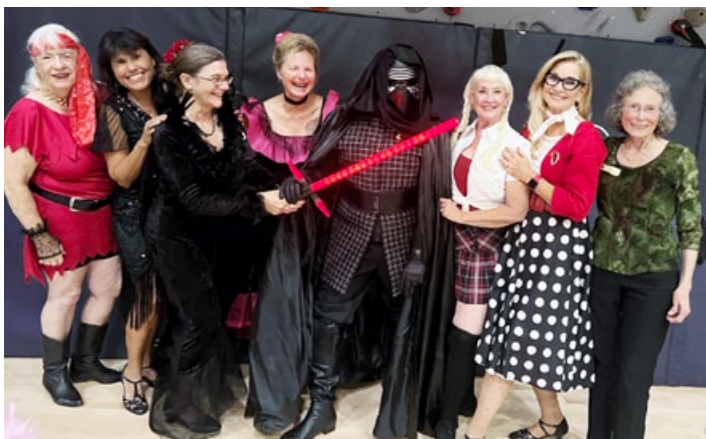
Fooling around with Darth Vader!