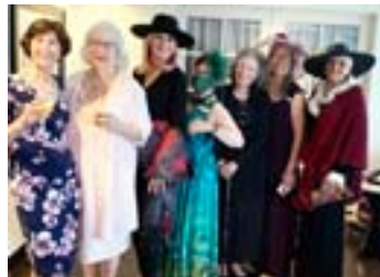
(Bottom) Palomar Queens decked out in their favorite hats at the Queens Luncheon