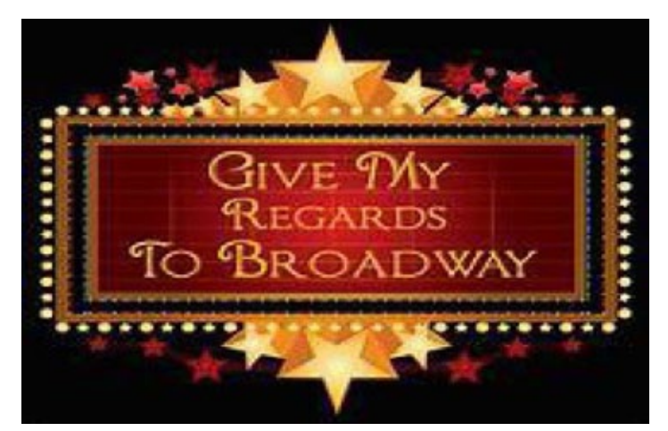
NSD Convention 2022 – 2-5 September

Join the National Smooth Dancers for a fun-filled Labor Day weekend of dancing as we 'Give Our Regards to Broadway' at the Margaritaville Resort in Palm Springs. Celebrate your love of musical theater with us as we watch little-known gems as well as some of the most successful and enduring musicals that graced the Broadway stage.