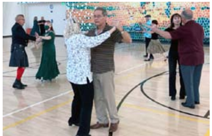
Palomar's Sunday afternoon tea dances have resumed at the Carlsbad Senior Center.