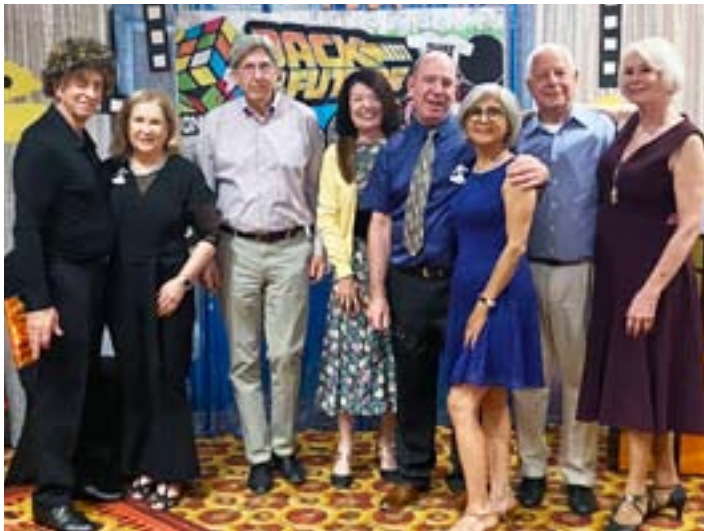
Visalia dancers gather for a photo in Bakersfield in March.

For Visalia dancers, it’s a happy coincidence of geography that Bakersfield is just down the highway from Visalia.