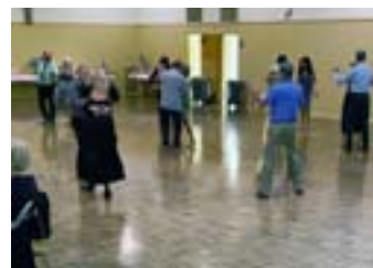
Dancers take the floor at the March dance social held by Visalia Smooth Dancers.

Several members of Fresno Smooth Dancers attended our February dance social – thank you for the support.