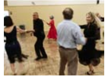
Visalia dancers take the floor at the February dance social.