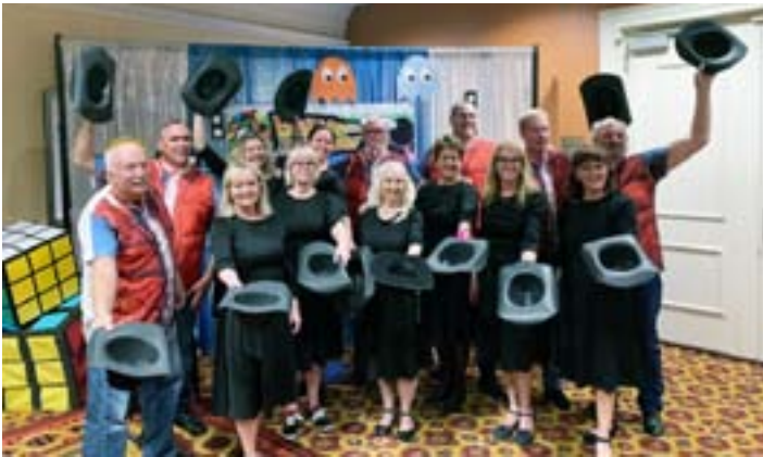
The Bakersfield Performance Team gives an Old Western Welcome at the March weekend dance.