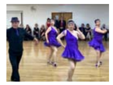
The Shaking Divas also performed a routine at the December dinner-dance.