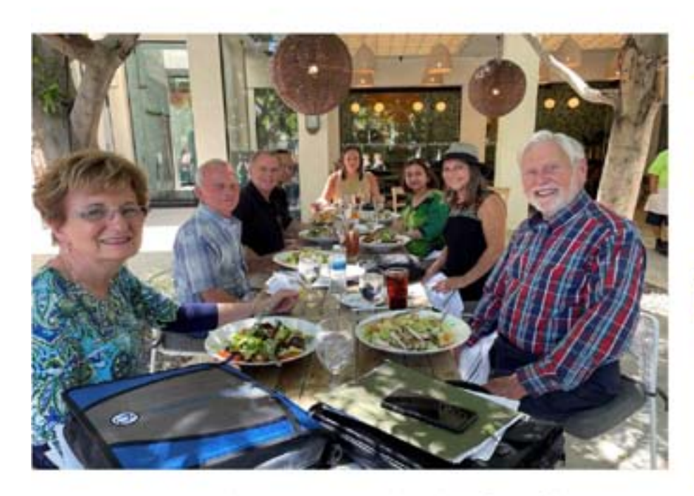
Our creative team enjoying lunch at Margaritaville Resort:

Join the San Diego Smooth Dancer for a trip to Broadway, the most famous theatrical district in the world. Take in Broadway sensations: My Fair Lady, Grease, Moulin Rouge, Chicago and the Big Deal.