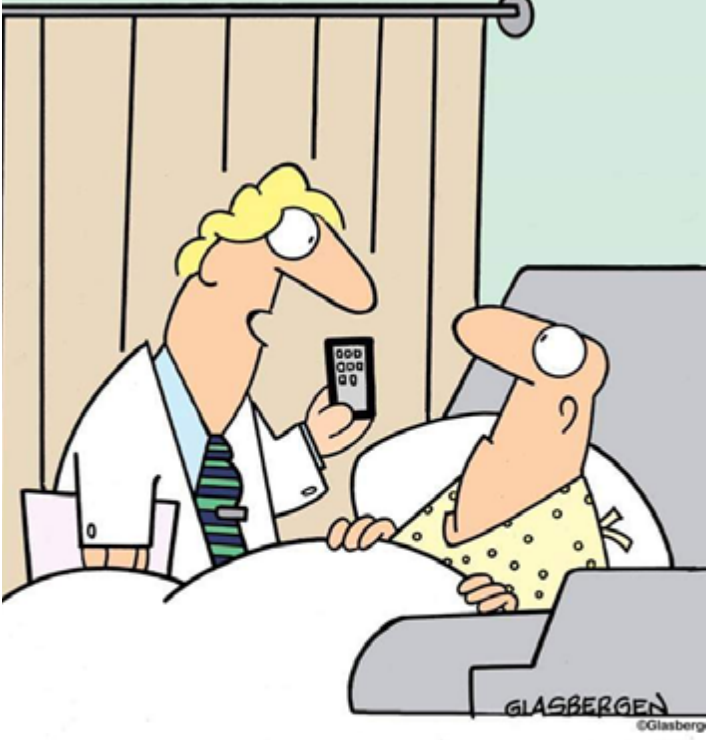
"Your new hip and knee replacements come with a remote control app for Tap, Waltz, Foxtrot, Cha-cha, Jitterbug, Texas Two Step, Irish Folk Dance and Disco."