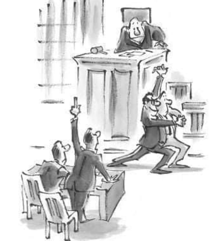
"Objection, Your Honor. Counsel is leading the witness."