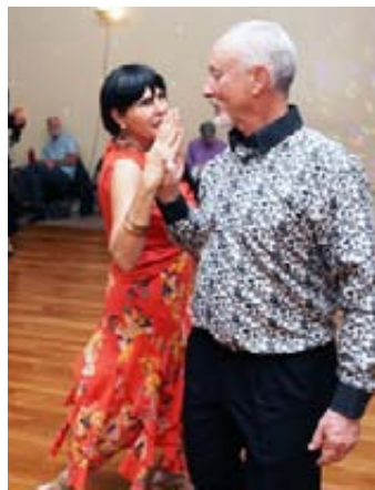
We dance because there is an amazing energy that comes from connecting movement with music, body, and spirit.