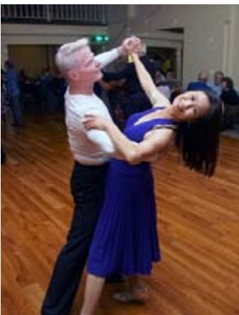
I can't help from feeling JOY when I dance the waltz!