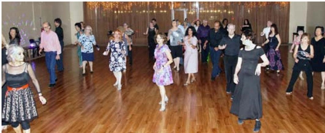
Everybody Dance Now!