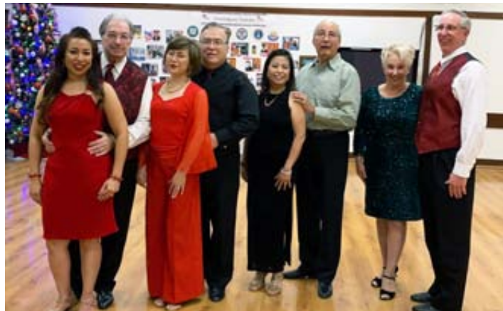
Above are the Jack n' Jill competitors at the annual Christmas Dinner Dance.