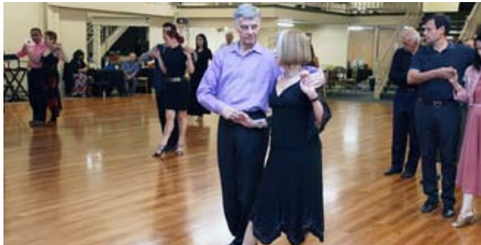
Cha Cha 1 2 3@ 4

DID YOU KNOW? Dance experts say Bachata will take the lead as Dance of the Year in 2020!