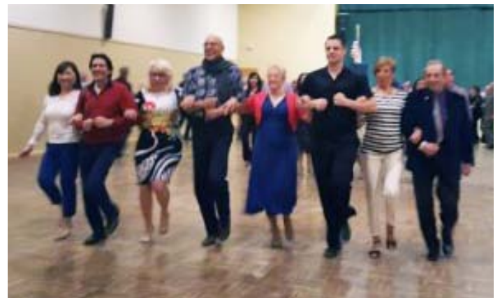
January Social Dance Members and Guests Marching in.