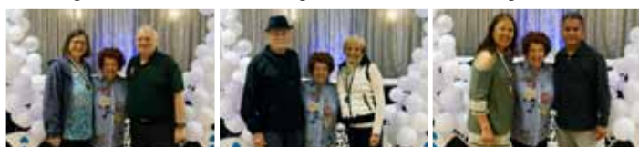
1st - Beginners Cha Cha 2nd - Beginners Cha Cha 3rd - Beginners Cha Cha