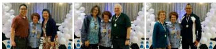
1st - Beginners Waltz 2nd - Beginners Waltz 3rd - Beginners Waltz