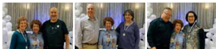
1st - Senior Waltz 2nd - Senior Waltz 3rd - Senior Waltz