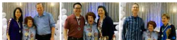
1st - Intermediate Smooth 2nd - Intermediate Smooth 3rd - Intermediate Smooth