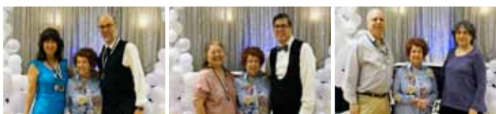
1st - Intermediate Rhythm 2nd - Intermediate Rhythm 3rd - Intermediate Rhythm