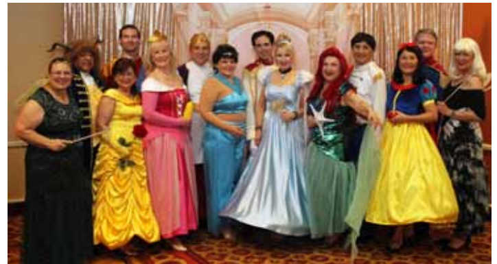
Bakersfield Friday Night Entertainment

Cinderella. Our fairy godmothers waved their magic wands, exclaimed "Bibbidi Bobbidi Boo!" and we emerged from the pages of a fairytale,