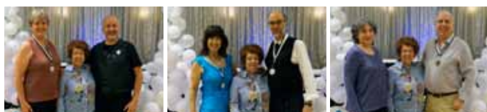
1st - West Coast Swing 2nd - West Coast Swing 3rd - West Coast Swing