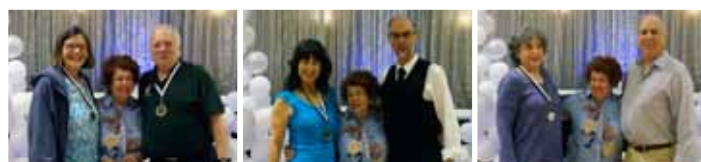
1st - East Coast Swing 2nd - East Coast Swing 3rd - East Coast Swing