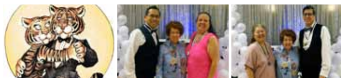
1st - Advanced Smooth 2nd - Advanced Smooth 3rd - Advanced Smooth