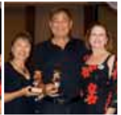
3rd - Two Star Smooth