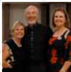
1st - One Star Rhythm