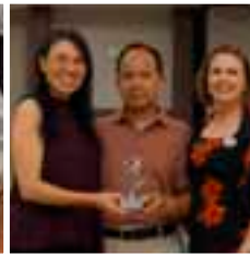
2nd - Three Star Rhythm