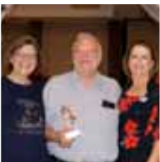
3rd - One Star Standard