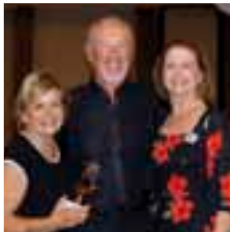
2nd - Two Star Rhythm