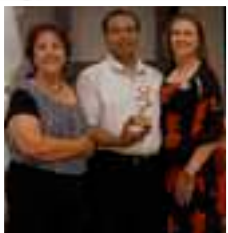
3rd - Three Star Std Latin