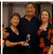
2nd - One Star Rhythm