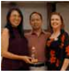
3rd - Two Star Rhythm