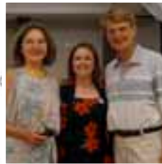
1st - Three Star Rhythm