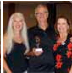
2nd - Two Star Smooth