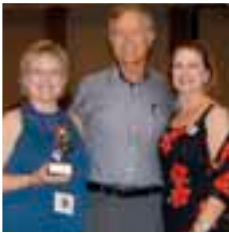
1st - Two Star Rhythm