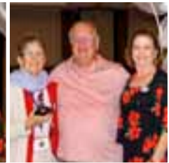
3rd - Senior Rumba