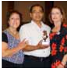
2nd - Three Star Smooth