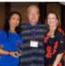
2nd - One Star Standard