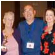
1st - Senior Cha Cha