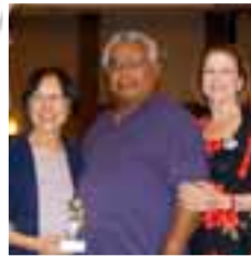
1st - Senior Rumba