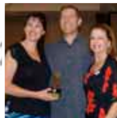
1st - Four Star Smooth