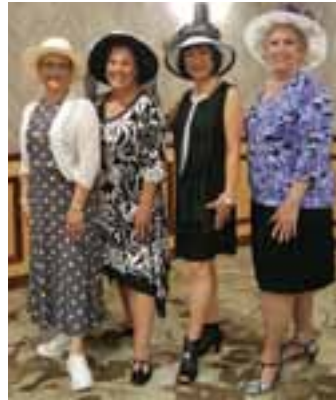
All our L.A. Queens at the queens' luncheon.