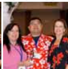
2nd - Four Star Smooth