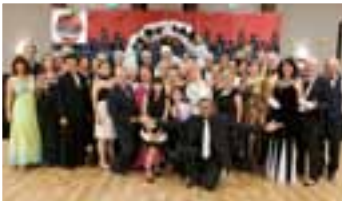
(Left) SFV Chapter – Our Night on Broadway