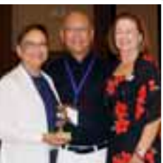
1st - One Star Standard