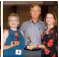
3rd - Three Star Rhythm