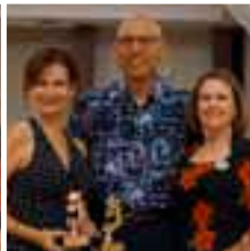
3rd - Senior Cha Cha