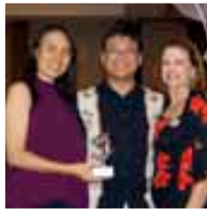
1st - Three Star Smooth