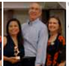
3rd - Four Star Smooth