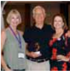
2nd - Senior Waltz