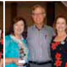
2nd - One Star Smooth