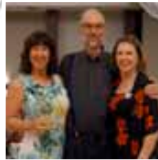
1st - Two Star Smooth