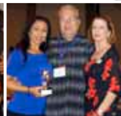
3rd - One Star Rhythm