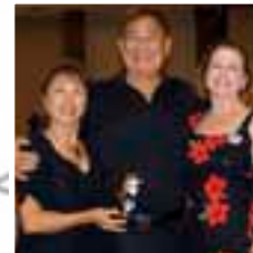
1st - One Star Smooth