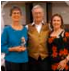
3rd - Senior Waltz