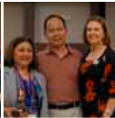
3rd - Three Star Smooth