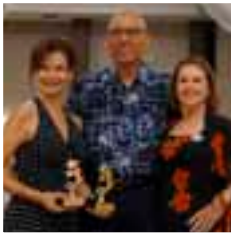
1st - Senior Waltz