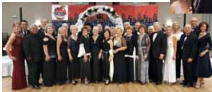
VSD group picture at Saturday night of the Convention.