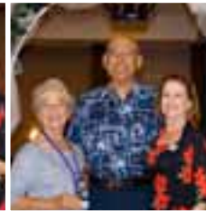
2nd - Senior Rumba