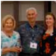
2nd - Senior Cha Cha