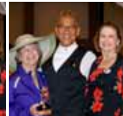
3rd - One Star Smooth