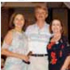
1st - Three Star Std Latin