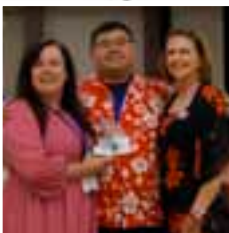
2nd - Three Star Std Latin