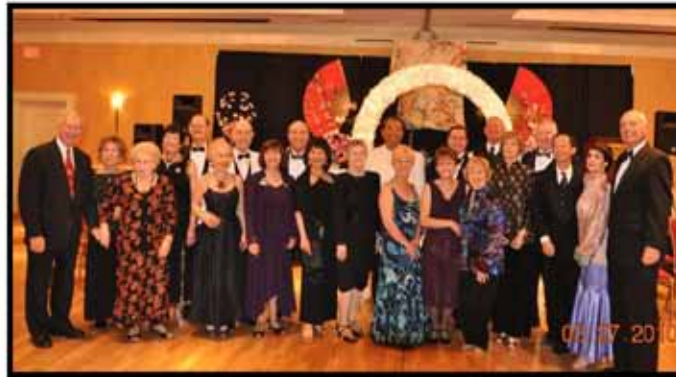
San Diego Smooth Dancers