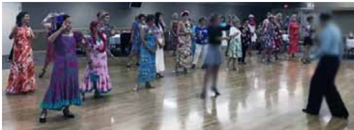
Our professional instructors teach The American Rumba to PSD members all in Luau attire at our July Social!