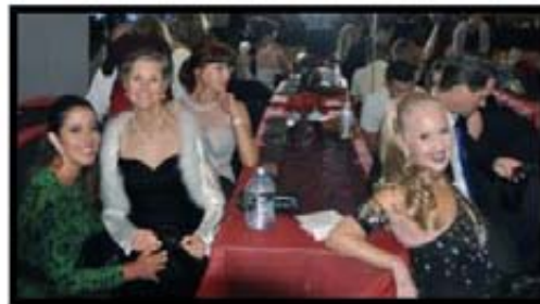
SDSD Members with other Guests attended the Showcase