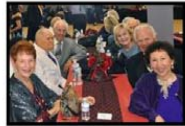
SDSD Members attended the Showcase