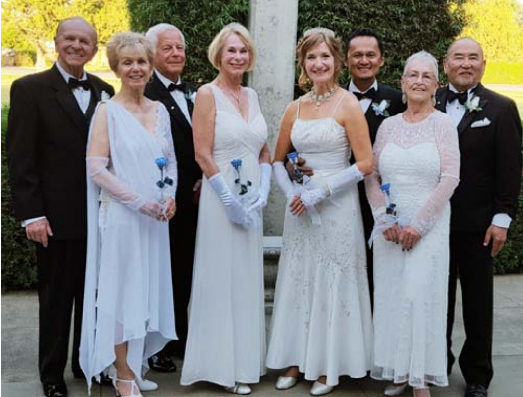
2018 Crowned Queens of Visalia Smooth Dancers with their Royal Escorts.