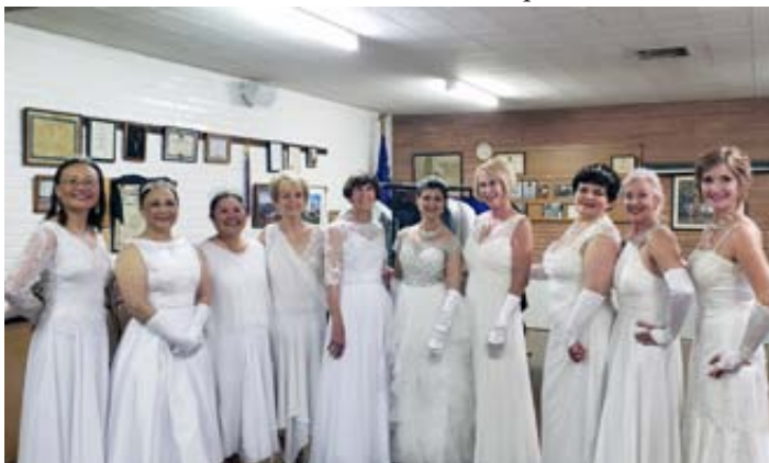
The Queens at the Visalia Coronation

The Visalia coronation included four queens to share their