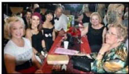
SDSD Members attended the Showcase