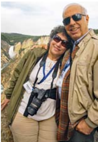
Meet the LaZar’s