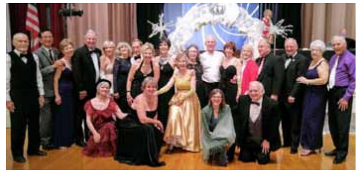
Palomar Chapter attendees at Bakersfield Coronation.