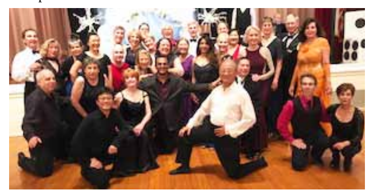
SFV Dancers At Their Best In Bakersfield

The annual Spring Bakersfield dance weekend was enjoyable for everyone. The James Bond theme was enthusiastic and thrilled all 40 of the SFV members that attended with our SFV Formation Team performing their dynamic Tango routine. Congratulations to all who attended and participated in the many competitions. Every year we sincerely look forward to this special dance weekend!