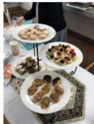
French Pastries for I Love Paris in the Fall.

We wish all our fellow Smooth Dancers safe, joyous and happy Holidays and a fabulous New Year! We look forward to sharing our love of dance with you throughout the year, especially at our 2018 Fresno Convention!