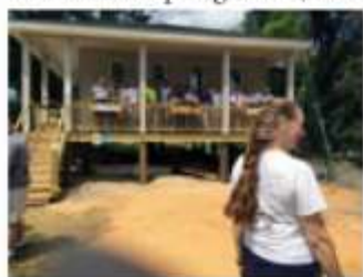
Dedication ceremony of a new home, elevated to meet the post-Katrina new flood elevations imposed by FEMA.