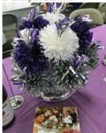
Gorgeous purple and white themed decorations transformed Champion Ballroom into a special celebration!