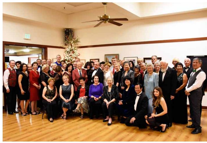
Our Christmas Party members and guests

All third-Sunday dances are at the Clovis Senior Center, 850 4th Street, Clovis, from 2:00 to 5:00 p.m. Cost is $5 for members and $10 for guests. See <a href="https://www.fresnosmoothdancers.org">www.fresnosmoothdancers.org</a> for flyers. We would love to see you there!!