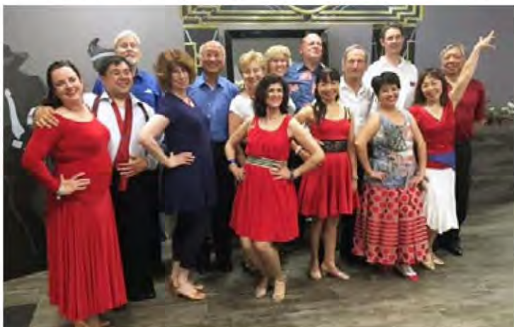
July Rumba and Quickstep Performance Group.