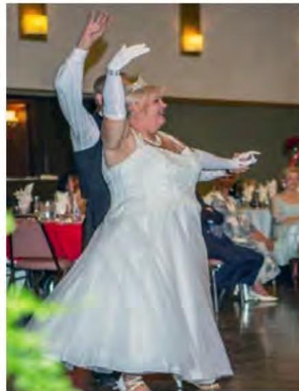
Queen Sharon's Waltz.

My coronation was absolutely beautiful! I was so happy to be crowned as our chapter Queen. It really was One Enchanted Evening. The tables were alternately decorated with red lights and red roses on white tablecloths and white lights and white roses on red tablecloths. The queens' arch had long fern streams with red and white roses across the top, red and white lights down the sides and covered with white tulle. There were shorter columns on both sides of the arch with red and white lights down them and topped with large ferns. Lights were draped across the front of the stage with large ferns placed on the stage with more roses.