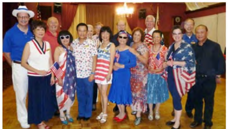
Looking Forward to seeing you at the Convention.