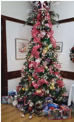
Look at all the donated toys!