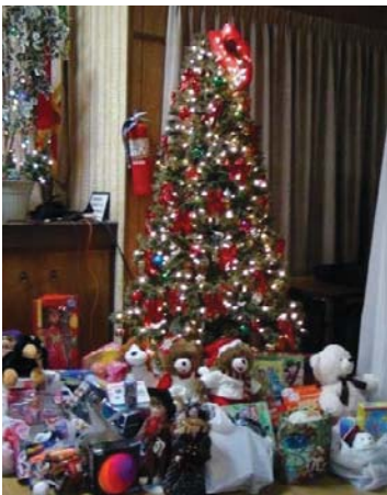
Members donated Christmas gifts to be distributed to those children who may not have received a gift.

The stage brightly flickered with trees and peaceful deer, while different scenes of Thomas Kinkade's cabins crossed the stage as a power point flashed during the dinner and Christmas music rejoiced the hearts. Two backdrops, one at the entry, the other by the Christmas tree covered with gifts, were glimmering with snowflakes so guests and members could keep a memory of their snowy adventure of Christmas Eve at the cabin.