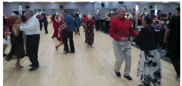
(Below) The new Champion Ballroom has opened at their new address; 4255 Ruffin Rd, #200, San Diego, CA 92123. The new facilities are wonderful with a fantastic dance floor.