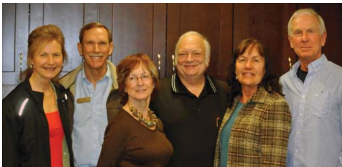
CONGRATULATIONS TO OUR NEW 2016 OFFICERS!