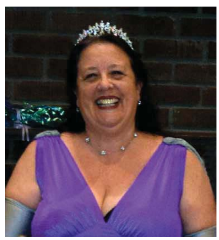
Queen Leanne Wong

coronation the ceremony when a new Queen (or King, let's not be sexist) is officially installed and is usually quite glitzy and full of grandeur.