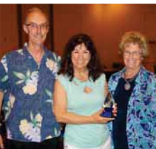
3rd - Three Star Rhythm