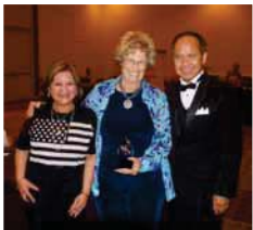
3rd - Three Star Latin