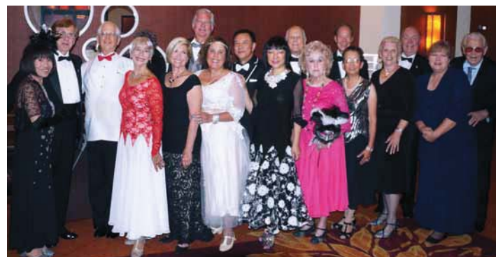
The Los Angeles Convention attendees.