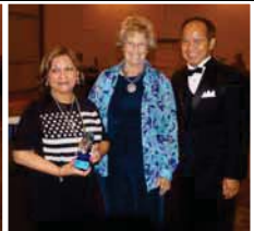
3rd - Three Star Smooth