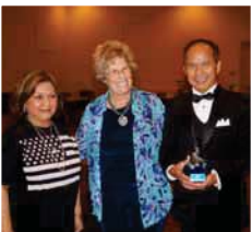
2nd - Three Star Rhythm