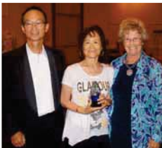
2nd - Three Star Latin