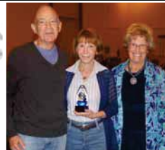
1st - One Star Rhythm