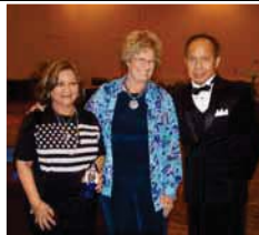
1st - Two Star Rhythm