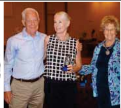
1st - One Star Smooth