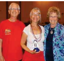
3rd - Three Star Standard