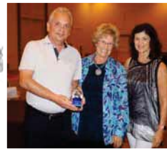
1st - Two Star Standard