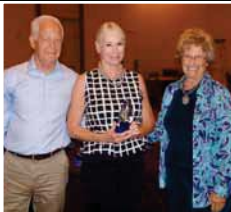
2nd - Two Star Rhythm