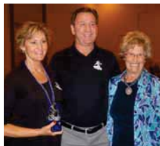
1st - Three Star Rhythm