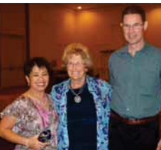
2nd - Two Star Smooth