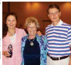
1st - Four Star Standard