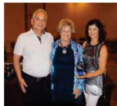
1st - Two Star Latin