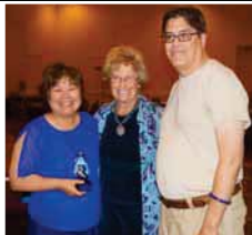
2nd - One Star Smooth