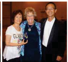
3rd - Four Star Standard