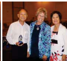
3rd - Two Star Latin