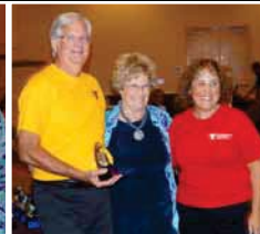
2nd - One Star Rhythm