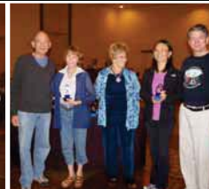
3rd - One Star Smooth