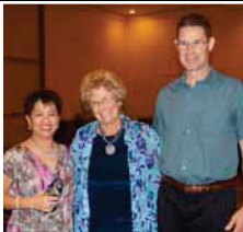
3rd - Two Star Rhythm