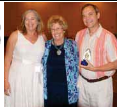
1st - Three Star Smooth