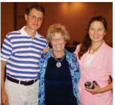
1st - Three Star Standard