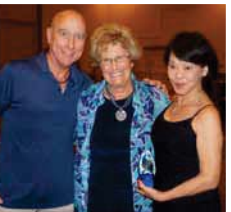
2nd - Three Star Standard