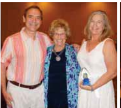
1st - Two Star Smooth