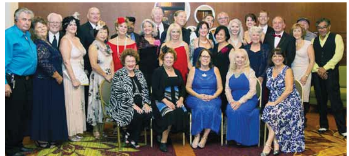
The Bakersfield Chapter members who attended the NSD 2015 Covention, Murder on The Orient Express, in Palm Springs over the Labor Day Weekend.

At this time, I would like to ask our members if they have any news you would like the chapter to know about to submit the information to me and I will print it or at least take it under consideration to write about.