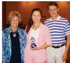
1st - Three Star Latin