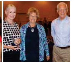
3rd - One Star Rhythm