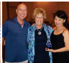
2nd - Four Star Standard