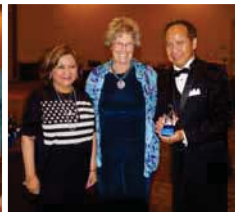
3rd - Two Star Smooth