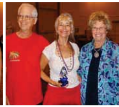
2nd - Two Star Standard