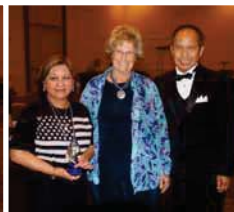
2nd - Two Star Latin