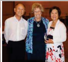
2nd - Three Star Smooth