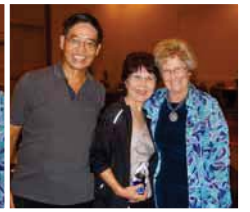
3rd - Two Star Standard