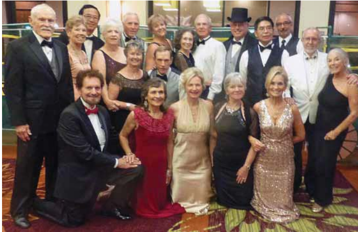
Palomar Chapter having a GRAND time at the Saturday Night Ball.