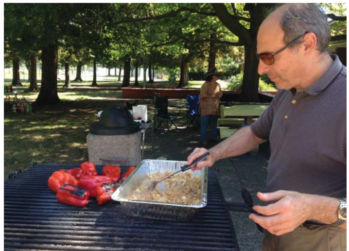
(Top Photo): Members gathered for the annual picnic held in Redwood City.