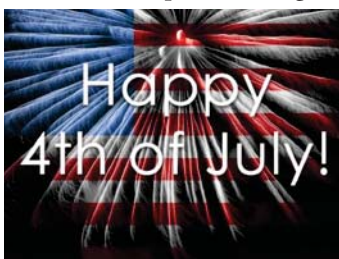
July 4th Recap Saturday in the park I think it was the Fourth of July People dancing, people laughing A man selling ice cream...

We will keep on dancing for another 54 years!