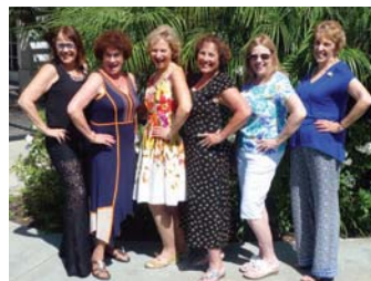
Queen Sandy hams it up for the camera at the Palomar Queen's Breakfast.

Russian area!" We are looking forward to their safe return