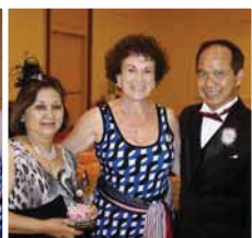
3rd - Three Star Smooth