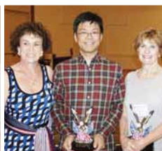
2nd - Four Star Standard