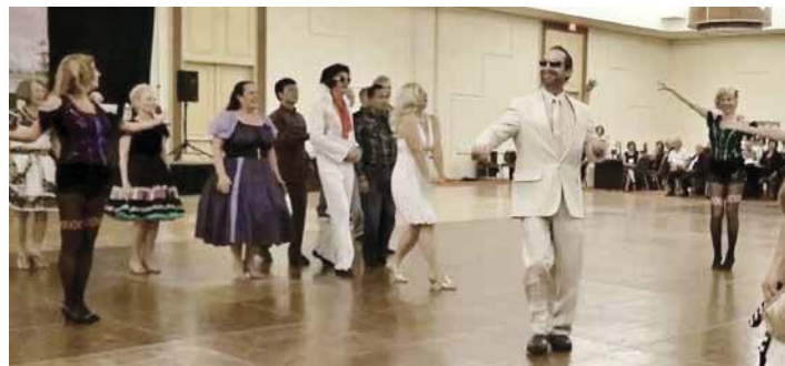
San Fernando performing Route 66 from Chicago to LA!

Congratulations to ALL Formation Teams for everything you put into the performances we all experienced throughout convention. What a challenge! But, your time, energy and endurance triumphed! How do you choose a winner? We are all winners in this category – after all the voting one team was voted #1 – GOLDEN GATE CONGRATULATIONS!