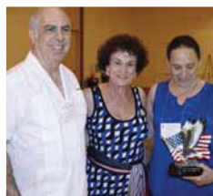
1st - Three Star Rhythm