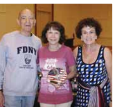
2nd - Senior Waltz