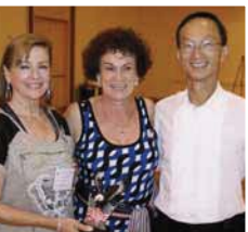
3rd - Three Star Standard