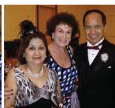
3rd - One Star Rhythm