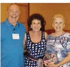
3rd - Senior Cha Cha