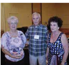
2nd - Senior Cha Cha