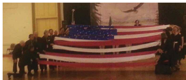
Palomar Chapter performing to Proud To Be An American!