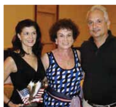
1st - One Star Standard