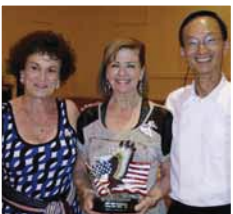
1st - Three Star Latin