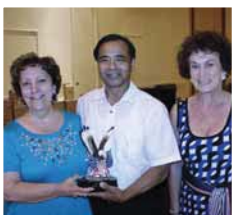
2nd - Three Star Rhythm