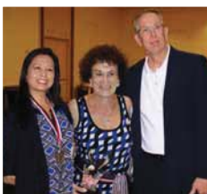
1st - Two Star Smooth