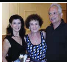
1st - Two Star Standard