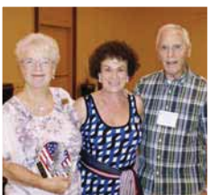
1st - Senior Waltz