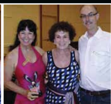
3rd - Two Star Rhythm