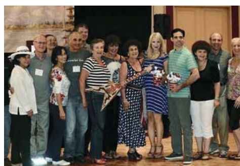
Golden Gate receiving their trophy!