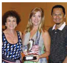
1st - Three Star Smooth