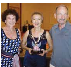
2nd - One Star Standard