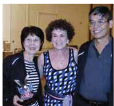
2nd - Two Star Latin