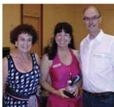
3rd - Two Star Smooth