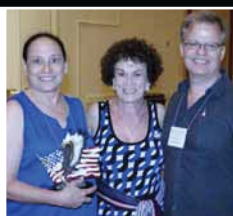
1st - Two Star Rhythm