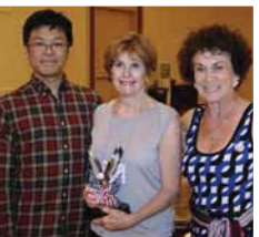
2nd - Three Star Standard