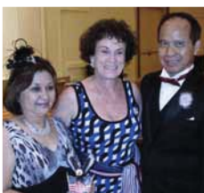
3rd - Two Star Latin