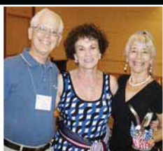
2nd - Two Star Standard