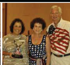
2nd - One Star Latin