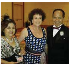
3rd - Three Star Rhythm