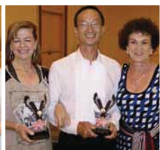
3rd - Four Star Standard