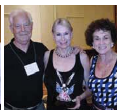
2nd - One Star Rhythm