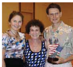
1st - Four Star Standard