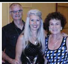
2nd - Two Star Rhythm