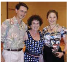
1st - Three Star Standard