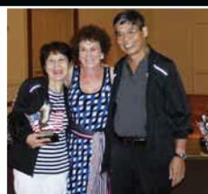
1st - One Star Latin