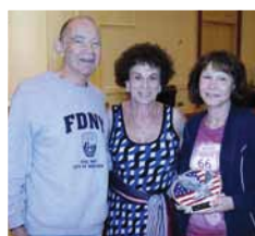
1st - Senior Cha Cha