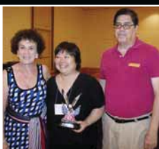
2nd - One Star Smooth