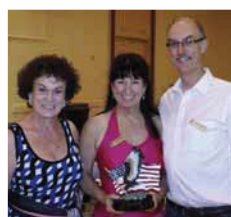
1st - One Star Rhythm