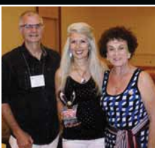
3rd - One Star Smooth