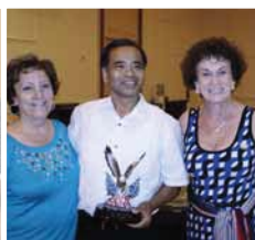
2nd - Three Star Smooth