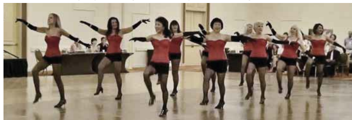
Bakersfield performing Welcome to Burlesque!