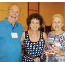
3rd - Senior Waltz