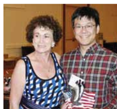
1st - Two Star Latin