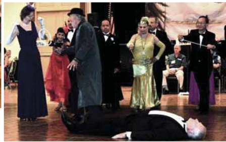
The suspects look over the crime scene