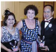
3rd - Three Star Latin