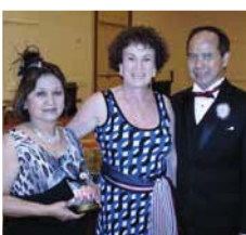
3rd - One Star Standard