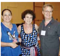
2nd - Two Star Smooth