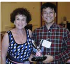
2nd - Three Star Latin