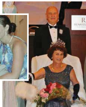
Our Newly Crowned Queen.