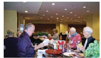
The Sunday night hospitality went smoothly, thanks in a large part to the enthusiastic team work of the entire club.