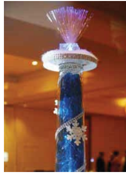
Lighted table decoration designed by Miriam Semeler bejeweled each table