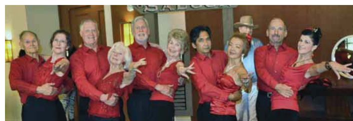
San Diego performed as The San Diego Paso Doble Team!