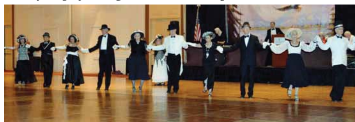
Los Angeles performing to New York New York!