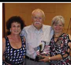
1st - One Star Smooth