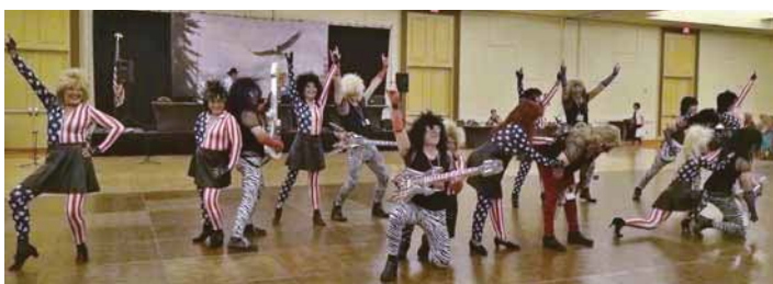
Golden Gate performing Battle of the sexes Rock n' Roll Style!