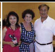
3rd - One Star Latin