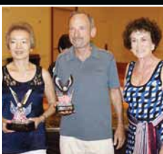
3rd - Two Star Standard