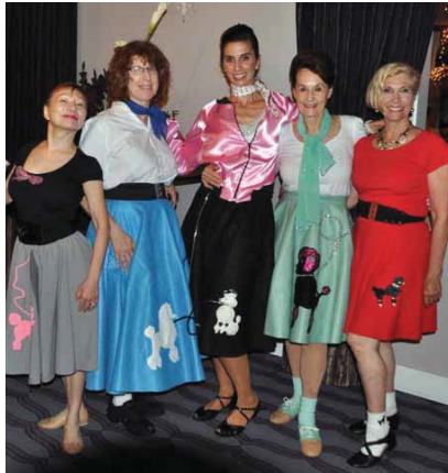
(Right) The 'At The Hop' team show off their poodle skirts, adding flair and fun to the June Social Dance.