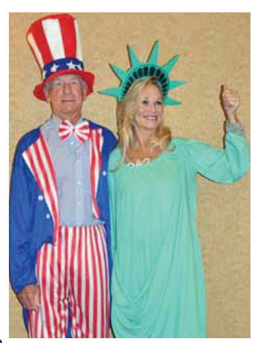
Uncle Sam & Miss Liberty welcome you as you tour across "America the Beautiful" at the Palm Springs Renaissance Hotel Labor Day weekend!