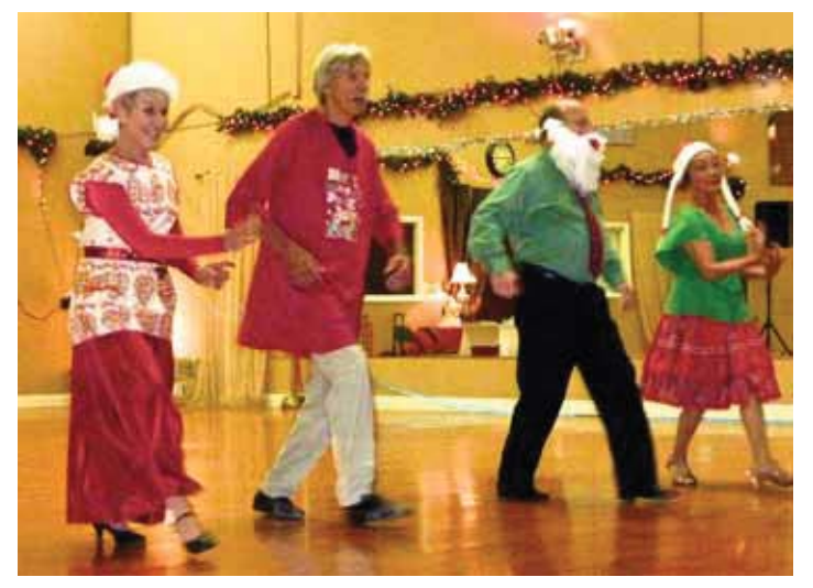
The Dance Now Team entertained us with a whimsical Christmas routine.

Christmas has come and gone. But fond memories linger from our holiday dance in December. Our Dance Now Team treated us to an adorable Christmas performance, complete with whimsical costumes and