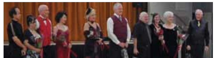
All of our Holiday Dinner and Dance performers take their final bow for the evening.