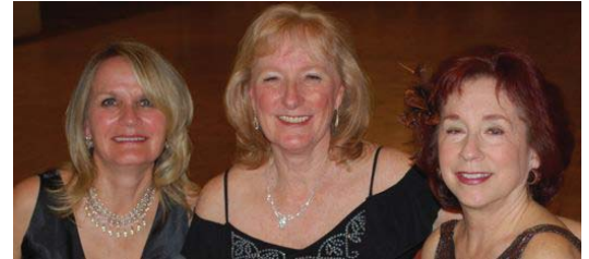
Santa Rosa Ladies

Our New Years dance is one of my favorites, as we can bring out all the bling a day early, meet up with our dance family, and stay safely at home when the rest of the world clutters up the roads, the restaurants and the ballrooms on December 31st.