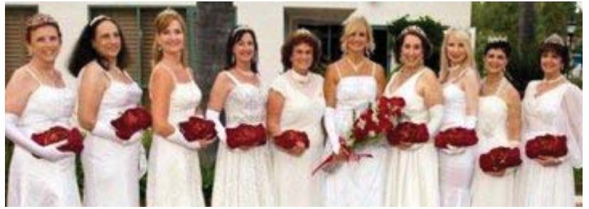
The Crown Circle