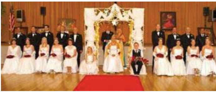
The Coronation Court