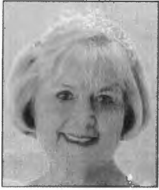
Queen Mary King